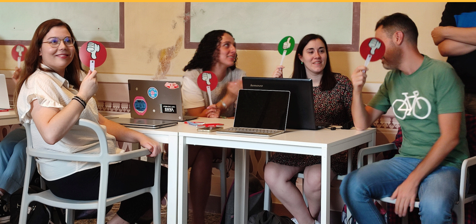
Ice-breaking session in the i-strategies HUB