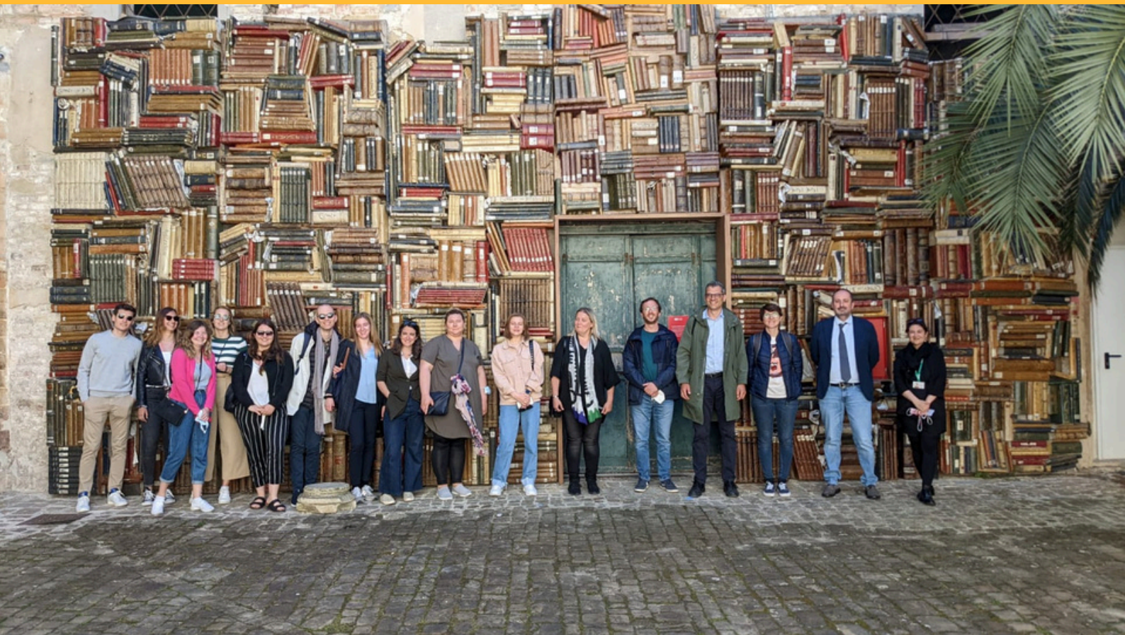
Group visit to local cultural sites