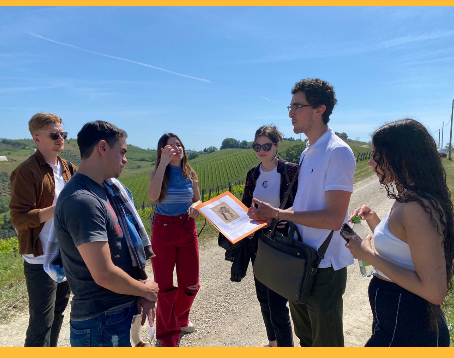
Discover local cultural heritage through a team game