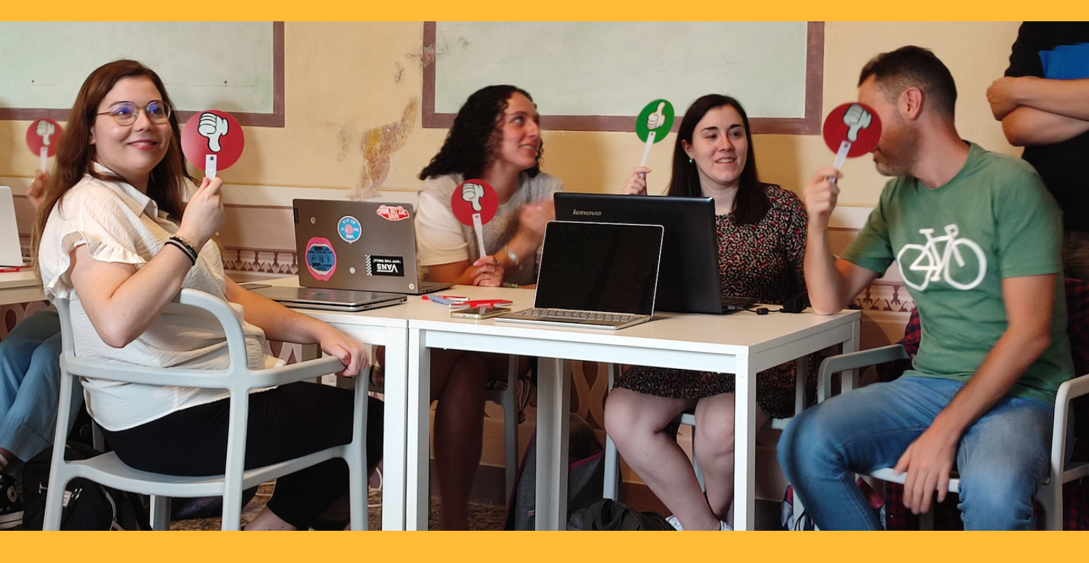
Ice-breaking session in the i-strategies HUB