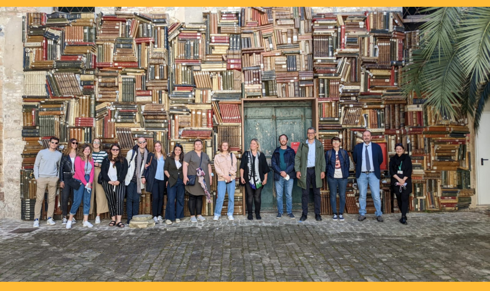
Group visit to local cultural sites